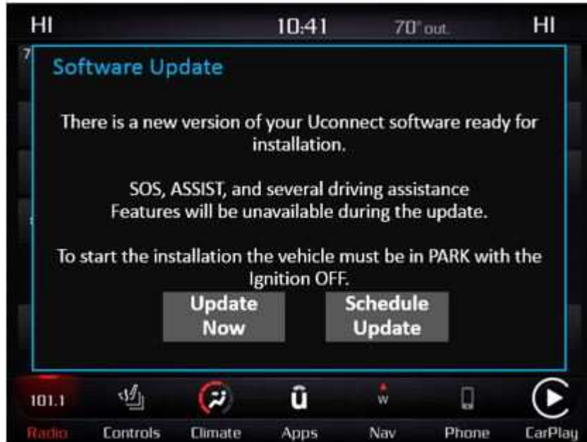
Fig. 1 Software Acceptance Screen

NOTE: If selecting “Schedule Update” the screen below will be displayed. The customer can select the exact time they want the update to begin (Fig. 2) .