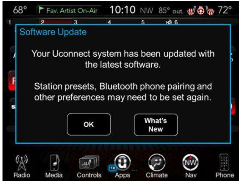
Fig. 4 Confirmation Screen