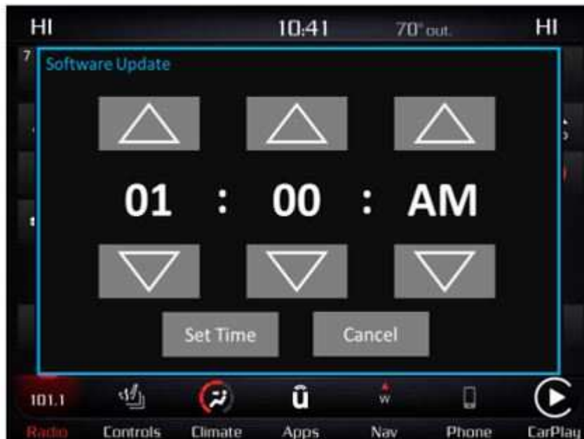
Fig. 2 Schedule Update Screen

NOTE: If selecting “Schedule Update” the screen below will be displayed. The customer can select the exact time they want the update to begin (Fig. 2) .