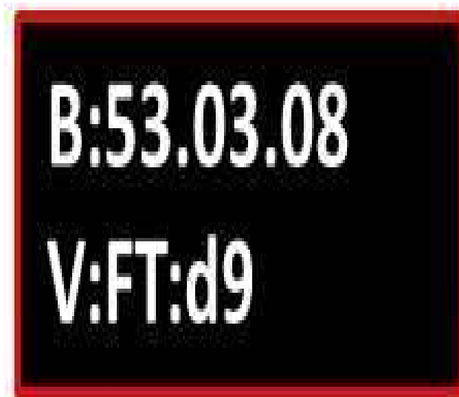
Fig. 10 Software Versions D

NOTE: Both lines on the display should match the versions above by Sales Codes RSP or RSQ.