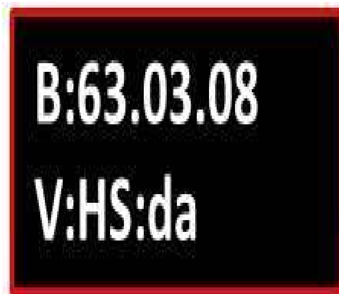
Fig. 1 Software Versions A