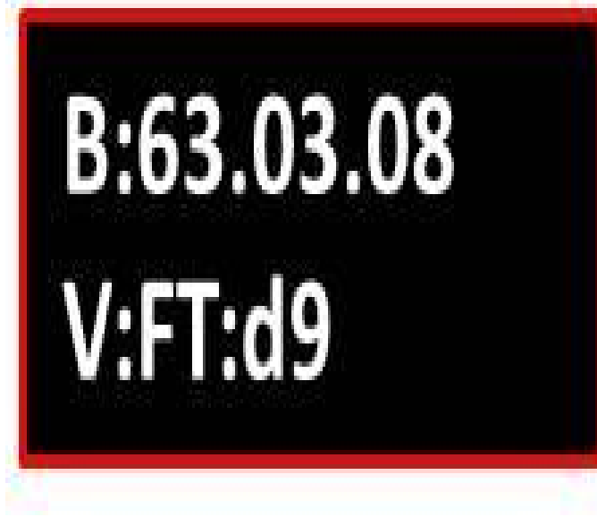
Fig. 2 Software Versions B