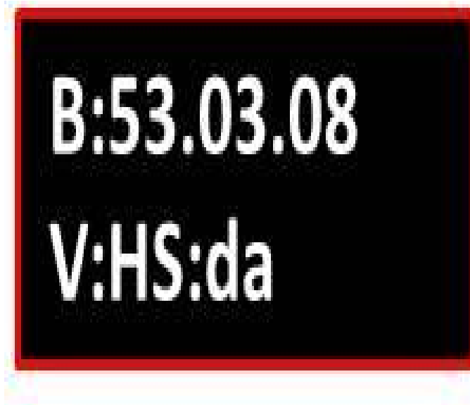
Fig. 3 Software Versions C