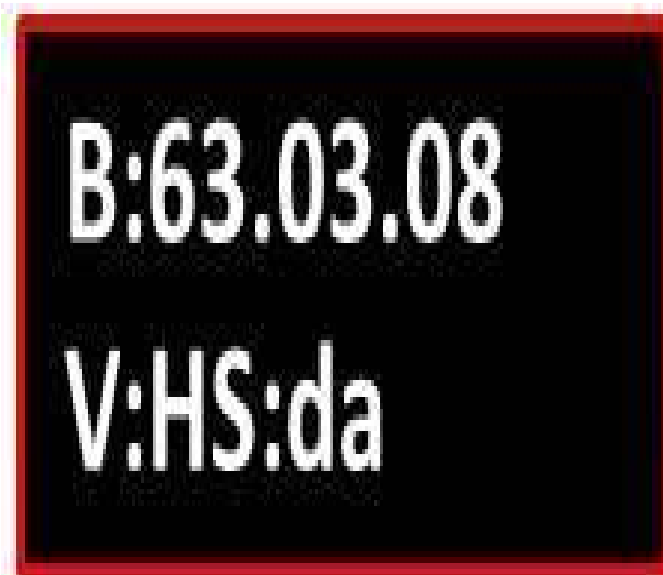
Fig. 7 Software Versions A