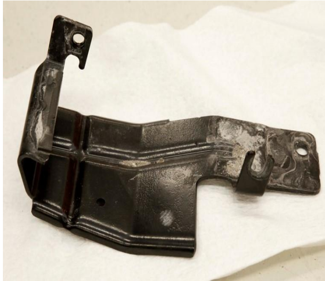
Fig. 2 Shield Before Cleaning and Foam Pad Installed

NOTE: Wait until the part is dry before moving to the next step.