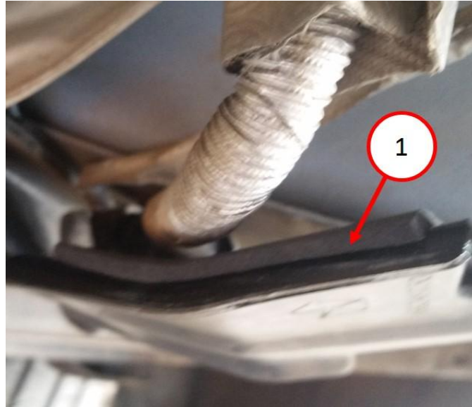
Fig. 4 Shield Installed With Foam Pad

5. Install the shield/deflector with the foam pad applied as shown in (Fig. 4).